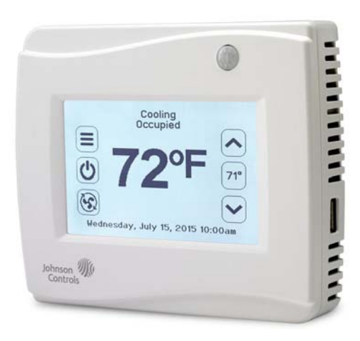
TEC3000 Series Thermostat Controller Shown with Occupancy Sensor